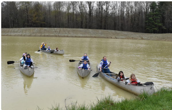
The expansion to Lake Nancy Van tripled the size of the previous lake, allowing more girls to enjoy water sports than ever before!

Thank you so much to the many donors that made these much-needed improvements to Camp Sugarbush possible.