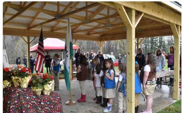
On May 1, 2022, the Camp Sugarbush Improvements were officially re-dedicated. Pictured: The event’s flag ceremony taking place beneath the new Waterfront Pavilion.