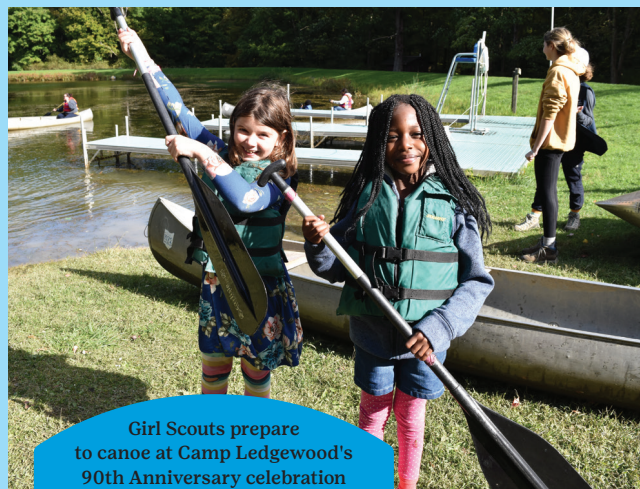
Girl Scouts prepare to canoe at Camp Ledgewood's 90th Anniversary celebration (2022)

Witnessing a Girl Scout return home from camp is a special sight to see. The excitement in their eyes and the energy in their presence is incredibly powerful. Staff at GSNEO, troop leaders, and caregivers have the pleasure of seeing first-hand how attending camp positively impacts a girl's character. GSNEO invites you to share in the joy of these moments and be a part of the camp experiences that shape girls' lives!