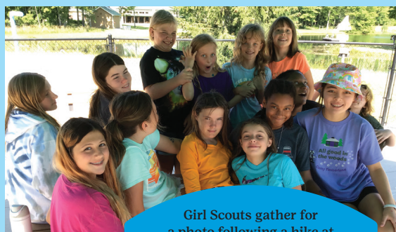
Girl Scouts gather for a photo following a hike at Camp Timberlane (2022)

"She gets to experience new things, meet new people, and make new friends. It helps instill a sense of confidence in herself, and is overall a wonderful experience."